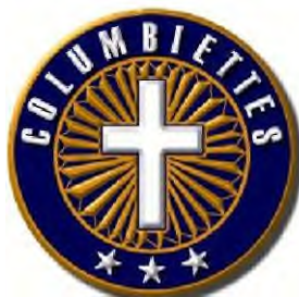
South Carolina State Council Columbiettes Officers