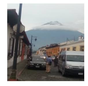
View of volcano looking down the street from our hotel in San Marcus