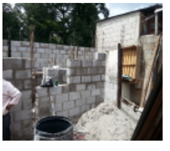
Day 4 at building site