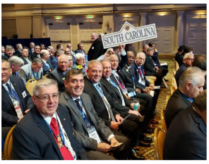
SC Delegates at Supreme Convention